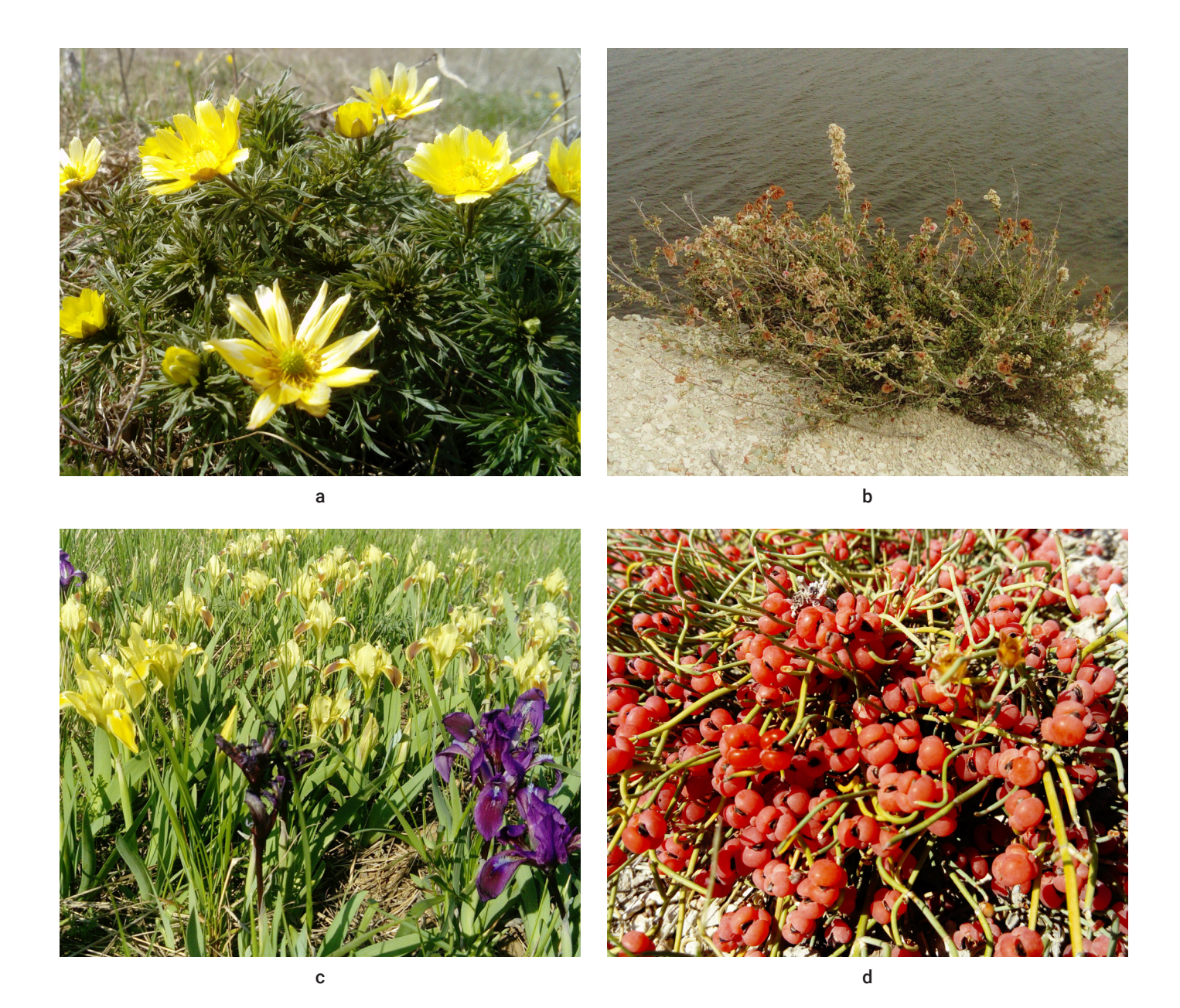
Figure 1. Some rare plant species of Saratov region: a – Adonis wolgensis, b – Atraphaxis replicata, c – Iris pumila, d – Ephedra distachya

work is under way [19–21]. A number of regions extensively implement grid mapping and analyze archive records, herbarium specimens and recent publications, as well as make use of the researchers' own field studies with subsequent IPA identification and introduction of a separate GIS issue-related layer within the existing systems. In the Oryol Region, for instance, such approach has ensured identification of 50 IPAs [22]. Similar activities are carried out in Perm Krai [23], the Murmansk [24] and Samara [25] regions and some other regions.