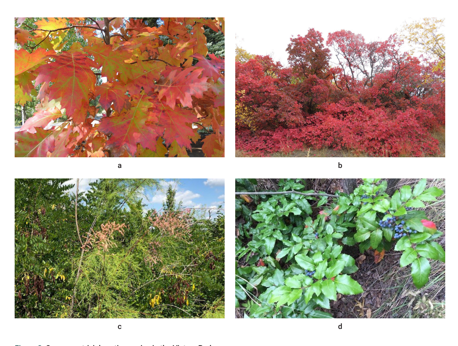
Figure 3. Some non-trivial exotic species in the Victory Park: a – Quercus rubra L., b – Cotinus coggygria Scop., c – Tamarix ramosissima Ledeb., d – Mahonia aquifolium (Pursh) Nutt.

native to the Saratov Region, and the rest are exotic species.